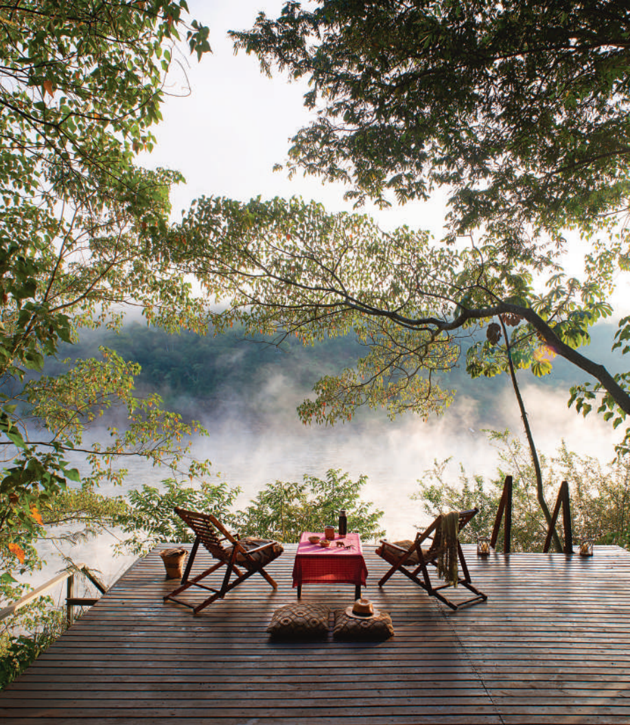
From top: a Hillside Pool Suite at Hermitage Bay; a peaceful perch at Awasi Iguazu.