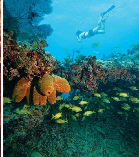
Clockwise from left: sand and surf in San Diego; the desert outside Dubai; a coral reef near Key West; a peek at El Yungue National Forest: the Texas State Capitol in Austin.