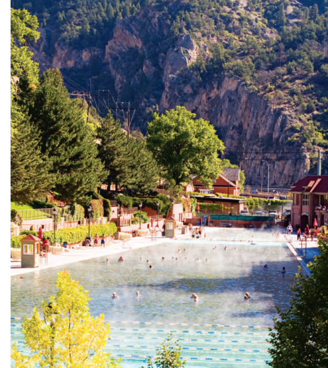
Glenwood Hot Springs in Colorado.