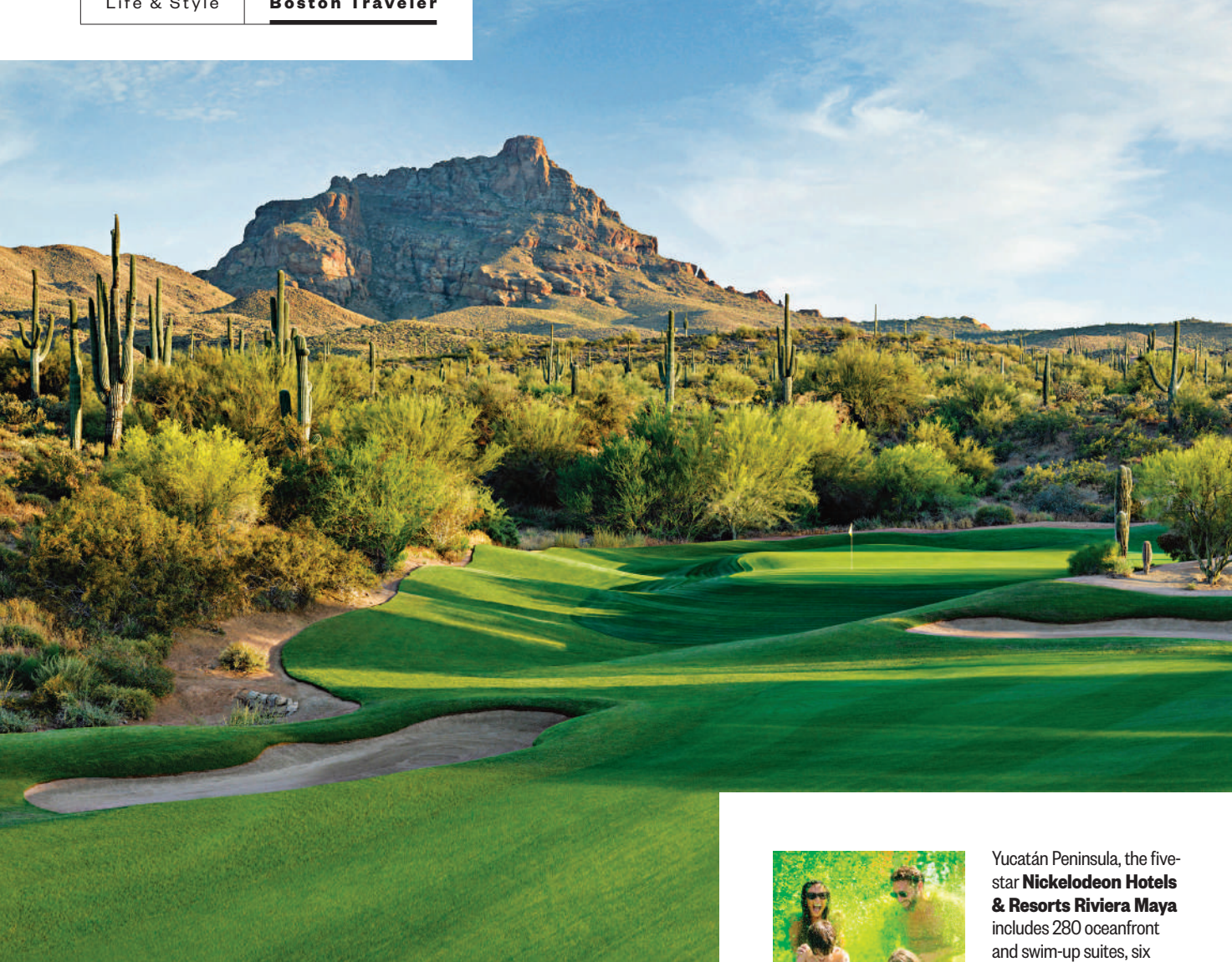
The Cholla course at We-Ko-Pa Golf Club.