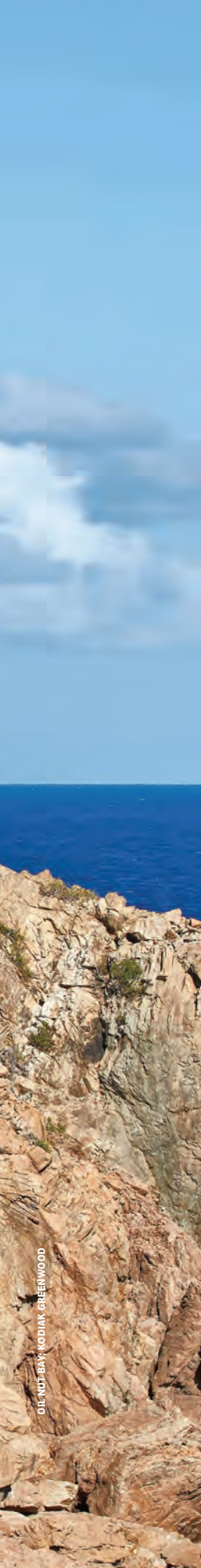
OIL NUT BAY: KODIAK GREENWOOD