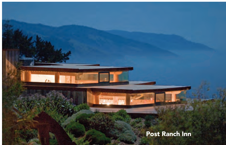
Post Ranch Inn

If you can’t bring yourself to choose between the mountains and the sea, Oil Nut Bay on Virgin Gorda’s North Sound gives you the best of both worlds, showcasing the cobalt water and rugged coastline. Accessible only by boat or helicopter, the exclusive property’s 26 accommodation offerings range from cliffside one-bedroom suites to six-bedroom villas, some as high as 700 feet above sea level. The 400-acre landscape offers five hiking trails for sweeping views of the Caribbean Sea, tennis and pickleball courts and an on-site barn for rescued animals including retired racehorses, an emu and flamingos. Venture into the water for snorkeling, reef diving, sea kayaking and sailing and refuel with an alfresco meal and a cocktail at Nova, the resort’s new overwater restaurant and bar.