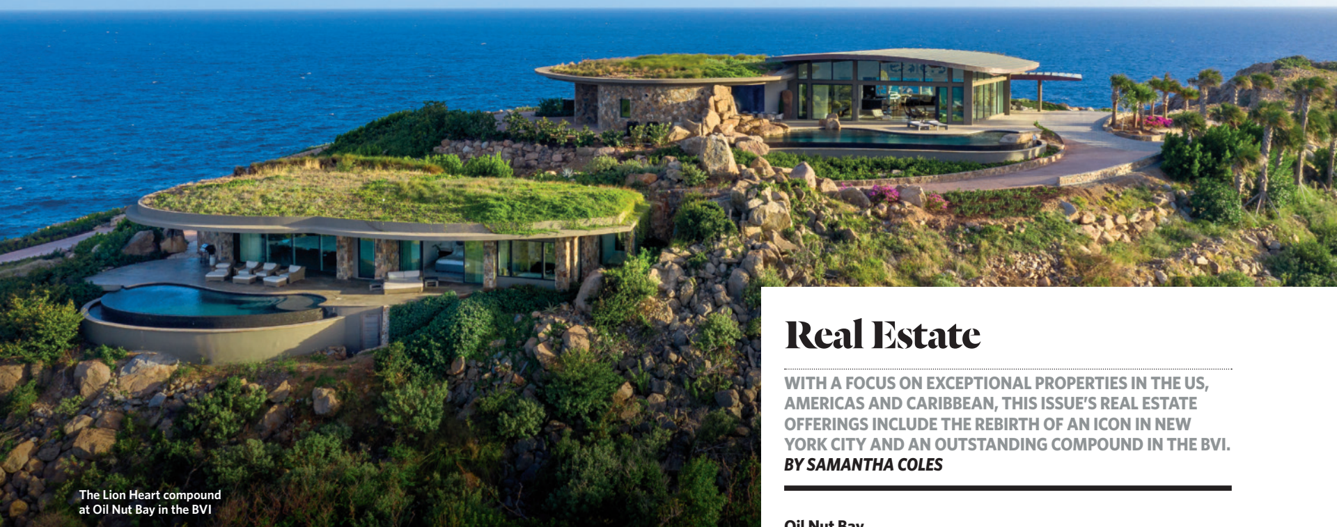
The Lion Heart compound at Oil Nut Bay in the BVI