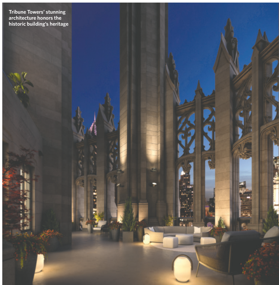
Tribune Towers' stunning architecture honors the historic building's heritage