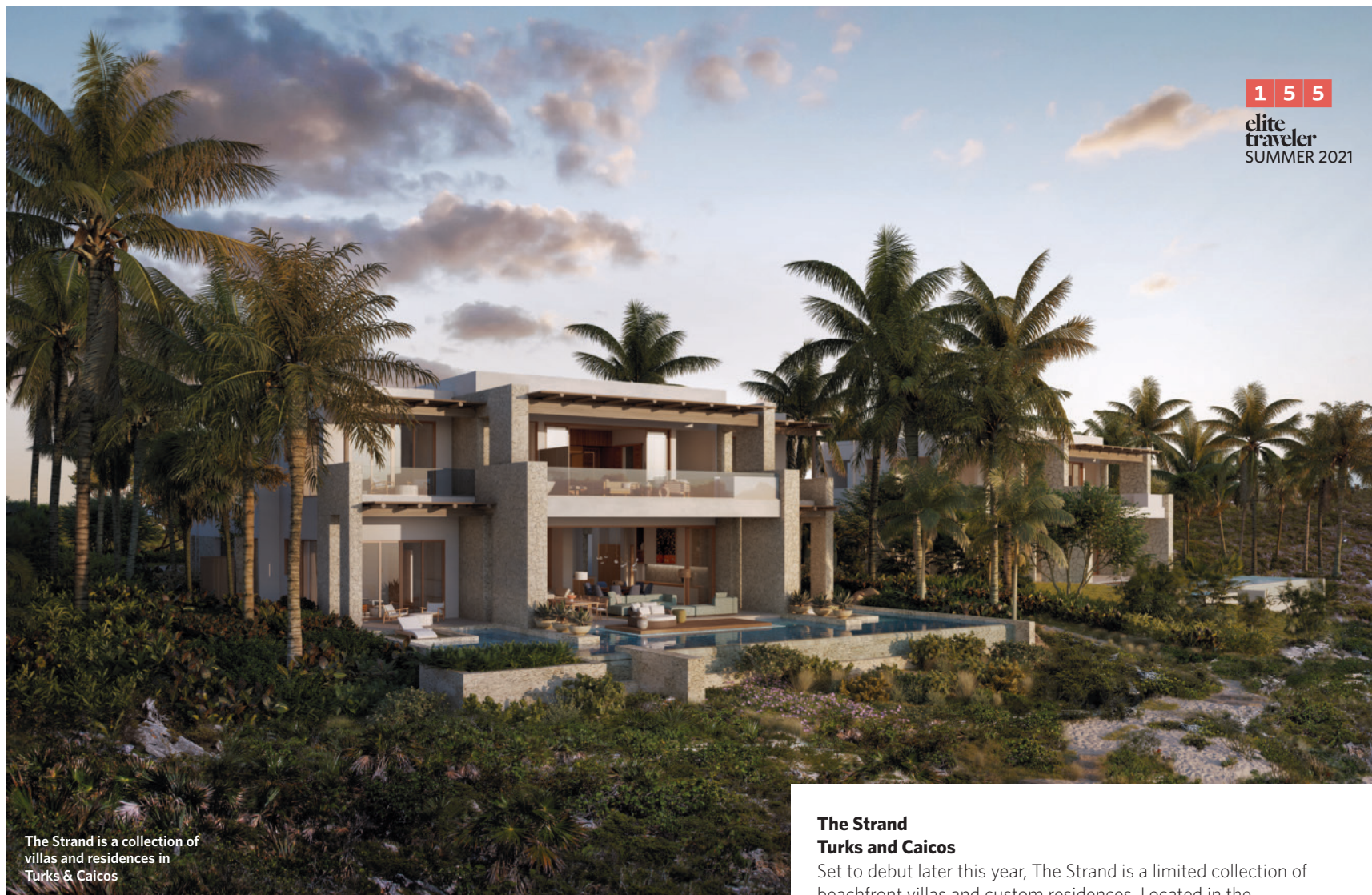
The Strand is a collection of villas and residences in Turks & Caicos